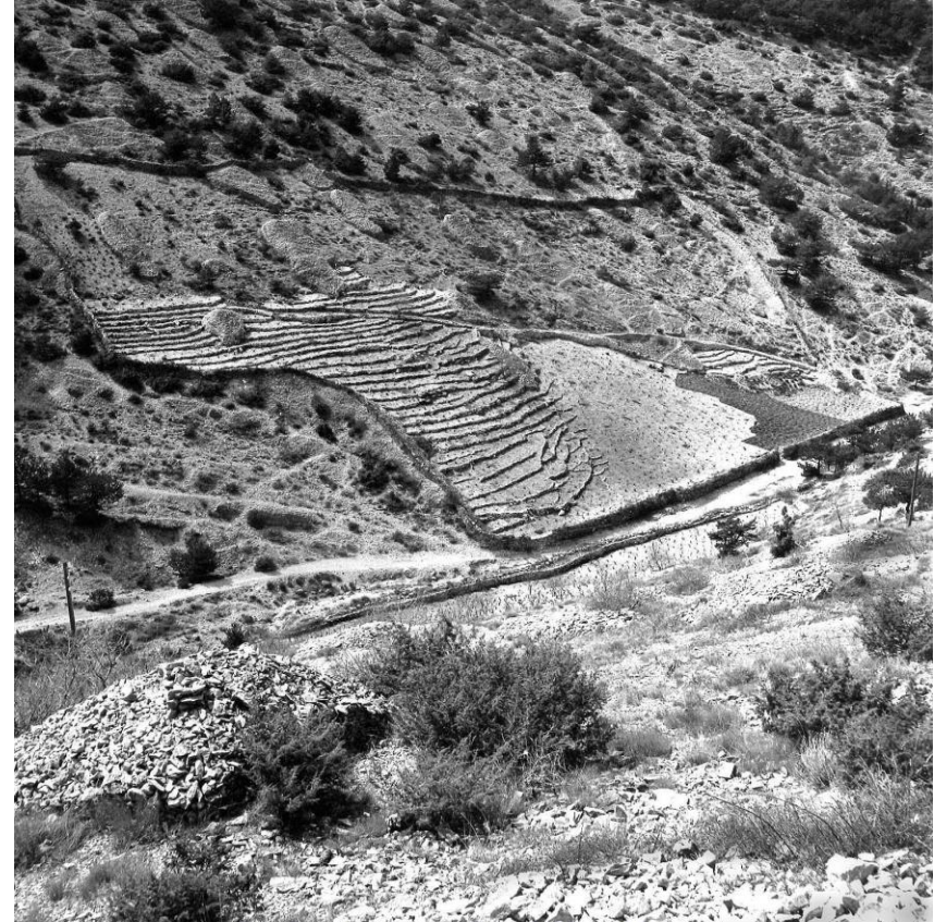
Kaskadni vinograd iznad Nerežišća